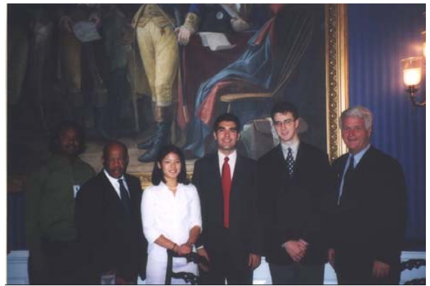
The Miller Fellows after breakfasting with Rep. Bill Delahunt and Civil Right Activist Rep. John Lewis

Finally, the Congressman revealed one of his own private passions, American history, as he laid out his support for the proposed Adams family Memorial in Washington, D.C., and offered succinct summaries of two recent, prominent works of historical scholarship. The morning was capped with a photo session involving the Miller Fellows, Congressman Delahunt, and the prominent civil rights activist and Congressman John Lewis.